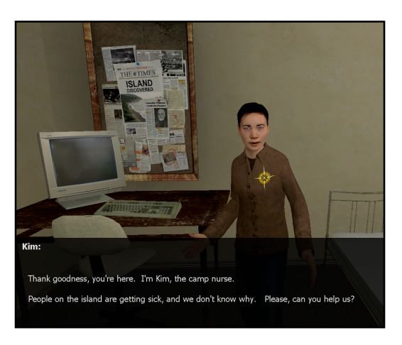
Figure 2. Crystal Island narrative environment.

The dynamic Bayesian network for knowledge tracing has been implemented in C++ using the SMILE Bayesian modeling and inference library developed by the University of Pittsburgh's Decision Systems Laboratory (Druzdzel, 1999). The model maintains approximately 135