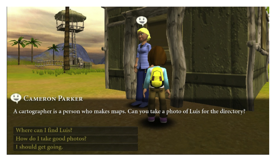
Fig. 1. Image taken of interaction between student avatar and character from CRYSTAL ISLAND.

Students played the CRYSTAL ISLAND (see Figs. 1 and 2) game after they had exposure to the curriculum landforms that related to the North Carolina standard course of study for fifth grade science. CRYSTAL ISLAND is an online computer game consisting of an immersive, 3-dimensional intelligent learning environment with a cast of characters situated on an island within a storyworld. It is in its third year of development as a NSF-funded, multidisciplinary project. For a virtual walkthrough of the game see http://www.intellimedia.ncsu.edu/videos/CI5-yearTwo-video.html. This version features an expansive island setting that has rivers, a delta, a dam, a plateau, a lake, several waterfalls, and a beach. Throughout gameplay, students have the opportunity to interact with characters (e.g., town mayor, citizens of the island) to learn about science related concepts and to obtain advice and guidance pertaining to game scenario completion. The CRYSTAL ISLAND content curriculum was generated from FOSS (Full Option Science System) and the NC standard course of study on landforms and ecosystems. One theoretical underpinning for CRYSTAL ISLAND is narrative-centered learning. Mott, Callaway, Zettlemoyer, Lee, and Lester (1999) introduced the theory of narrative-centered learning to virtual worlds by building on Gerrig's (1993) two principles of cognitive processes in narrative