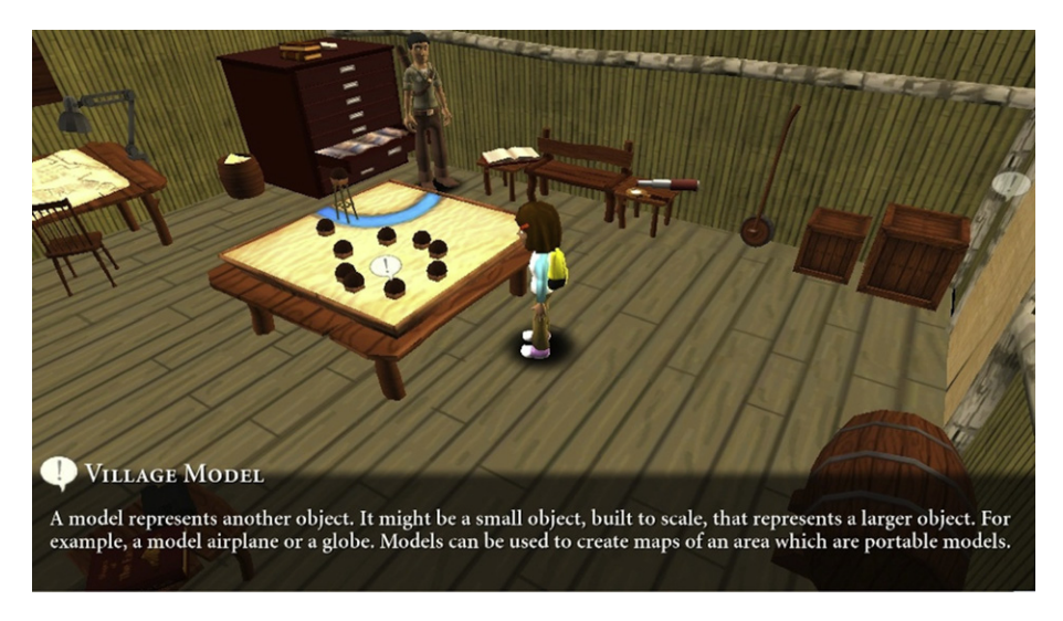
Fig. 2. Image taken of student avatar learning about models in CRYSTAL ISLAND.

comprehension. First, readers are transported; they are somehow taken to another place and time in a manner that is so compelling it seems real. Second, they perform the narrative. Simulating actors in a play, readers actively draw inferences and experience emotions prompted from interactions with the narrative text. Students learn content as they experience the narrative.