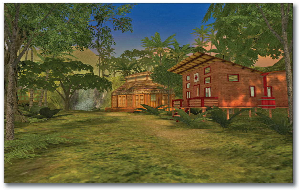
Figure 1. Crystal Island Narrative-Centered Learning Environment.

environments by presenting Crystal Island, an intelligent game-based learning environment for middle grade science education (Rowe et al. 2011). Crystal Island has been under continual development through a series of learning technology investigations and laboratory and classroom studies over the past seven years. We discuss technical problems that we have investigated in the context of Crystal Island, including narrative-centered tutorial planning, student affect recognition, student modeling, and student goal recognition. We conclude with a discussion of educational impacts of intelligent game-based learning environments, and future directions for the field.