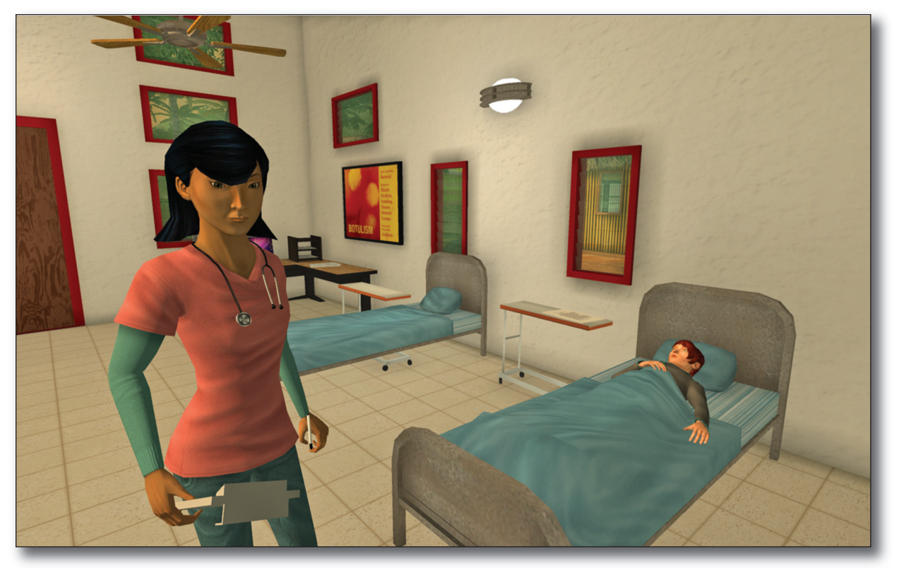
Figure 2. Camp Nurse and Sick Patient in Virtual Infirmary.

player-character disembarking from her boat shortly after arriving on the island. After completing a brief tutorial that introduces the game's controls, the player leaves the dock to approach the research camp. Near the camp entrance, the student encounters an infirmary with several sick patients and a camp nurse. Upon entering the infirmary, the student approaches the nurse and initiates a conversation (figure 2). The nurse explains that an unidentified illness is spreading through the camp and asks for the player's help in determining a diagnosis. She advises the student to use an in-game diagnosis worksheet in order to record her findings, hypotheses, and final diagnosis (figure 3). This worksheet is designed to scaffold the student's problem-solving process, as well as provide a space for the student to offload any findings gathered about the illness. The conversation with the nurse takes place through a combination of multimodal character dialogue — spoken language, gesture, facial expression, and text — and player dialogue menu selections.