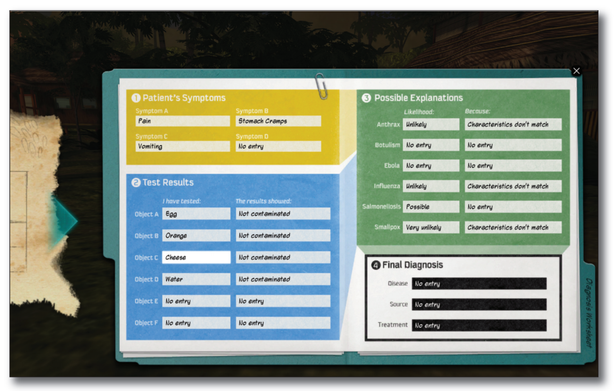
Figure 3. Diagnosis Worksheet Where Students Record their Findings.