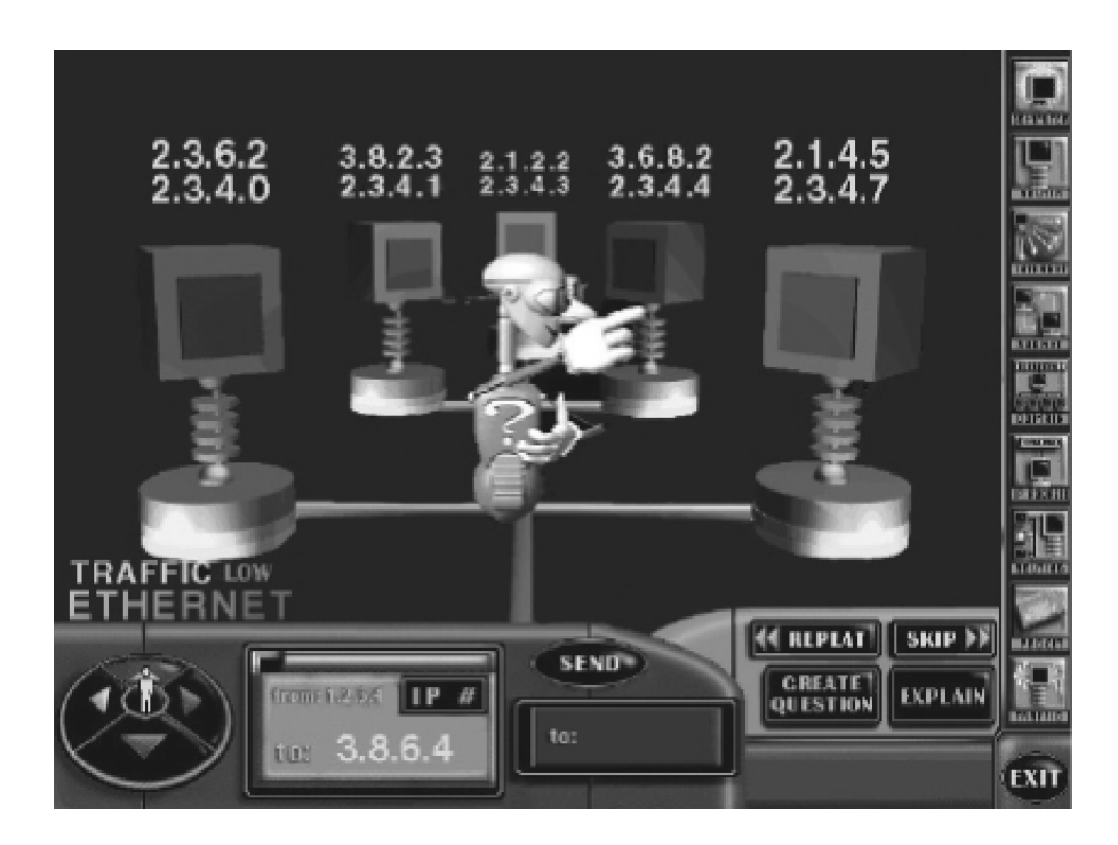
Figure 1. COSMO and the INTERNET ADVISOR learning environment