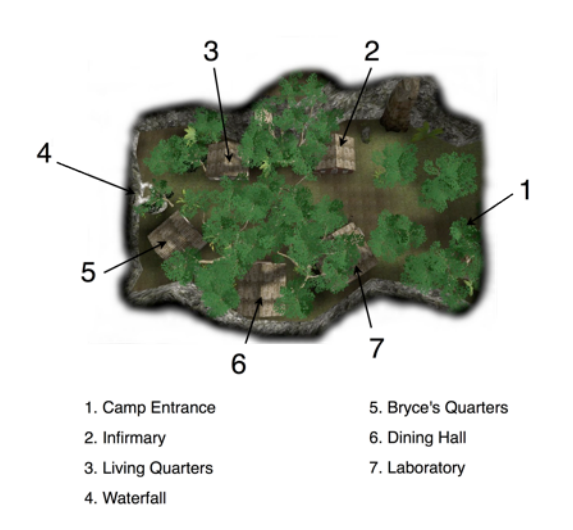
Figure 2. Map of the CRYSTAL ISLAND research camp.

questions about viruses and bacteria. The student can also learn more about pathogens by viewing posters hanging inside of the camp's buildings or reading books located in a small library. In this way, the student can gather information about relevant microbiology concepts using resources that are presented in multiple formats.