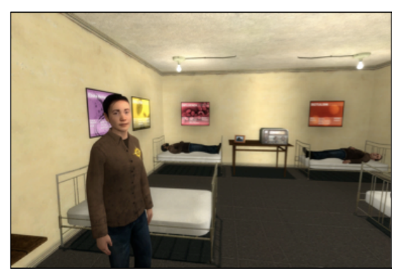
Figure 1. CRYSTAL ISLAND virtual environment.

Student interactions with CRYSTAL ISLAND are comprised of a diverse set of actions occurring throughout the seven major locations of the island's research camp: an infirmary , a dining hall , a laboratory , a living quarters , the lead scientist's quarters , a waterfall , and a large outdoors region. Students can perform actions that include the following: moving around the camp , picking up and dropping objects , using the laboratory's testing equipment , conversing with virtual characters , reading microbiology -