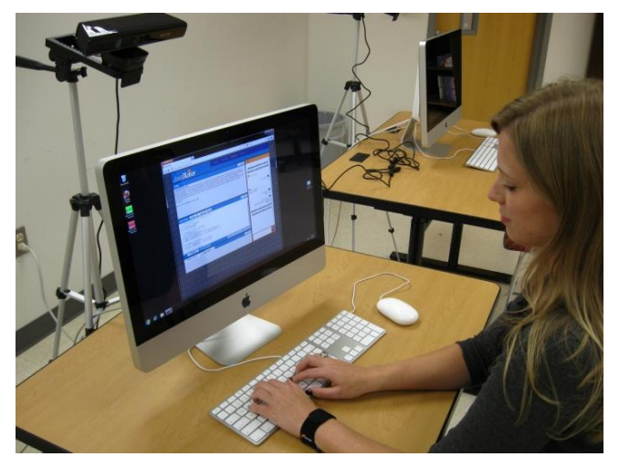
Figure 1. Student workstation with depth camera, skin conductance bracelet, and computer with webcam

course credit in an introductory engineering course, but no prior computer science knowledge was assumed or required. Each student was paired with a tutor for a total of six sessions on different days, limited to forty minutes each session. Recordings of the sessions included database logs, webcam video, skin conductance, and Kinect depth video. This study analyzes the webcam video corpus. The student workstation configuration is shown in Figure 1. The JavaTutor interface is shown on the next page in Figure 3.