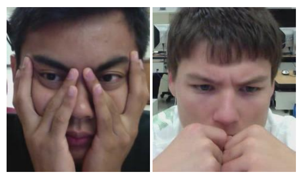
Figure 7. Facial recognition errors due to gestures: mostly occluded (left) and partially occluded (right)

A difficulty that remains for facial expression recognition is face occlusion, where the face is covered by an object, hand, etc. One source of face occlusions is hand-to-face gestures [14], where one or two hands touch the lower face. These gestures are particularly prominent in our tutoring video corpus, as students often place a hand to their face while thinking or cradle their head in both hands while apparently tired or bored. These gestures can result in loss of face tracking or incorrect output. Accordingly, our analyses considered only video frames where face tracking and registration were successful (i.e., where CERT produced facial action unit output). Examples of both types of occlusion errors are shown in Figure 7. The CERT adjusted output values for the mostly occluded face frame (in the left image) are [AU1 = 1.34, AU2 = 0.65, AU4 = 0.62, AU7 = 0.30, AU14 = -1.17]. If these values are interpreted with the 0.25 threshold, then they represent presence of multiple action units, but that is clearly not the case when viewing the video. CERT was unable to find the student's face in the partially occluded frame (in the right image), though the presence of brow lowering is apparent. While hand-to-face gestures present a significant complication in naturalistic tutoring data, there has been preliminary progress toward automatically detecting these gestures [14], so their effect may be mitigated in future facial expression tracking research.