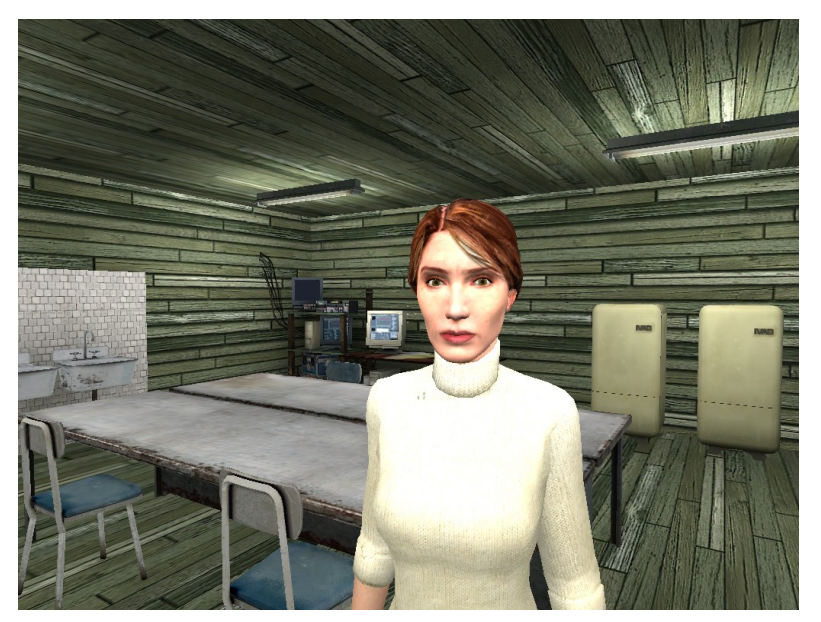
Figure 2: CRYSTAL ISLAND Learning Environment

how a student feels she is performing on a given task. For example, students often take pleasure in successfully completing tasks, while negative emotions, such as frustration, often accompany learning impasses. Motivation is an internal state that influences the activities students' engage in and their persistence in such activities. It can also increase activity levels in students and guide students in the direction of particular goals [18]. Adapting tutorial strategies that foster positive affective states affords a broad range of potential learning benefits, such as effectiveness, efficiency and transfer, since students tend to persist longer and put forth more effort in problem-solving activities when they enjoy what they are learning and believe in their abilities to succeed [39]. For these reasons, it is essential to coordinate affective reasoning with student modeling as well as with the tutorial and narrative planners.