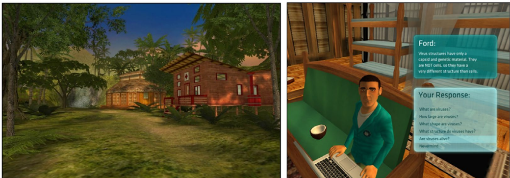
Figure 1: The CRYSTAL ISLAND game-based learning environment

To capture prior knowledge, we calculated the total number of correct answers on the pretest ( M = 11.84 , SD = 2.74 ) which were included as a feature for the predictive models. Similarly, we calculated the total number of correct answers on the posttest ( M = 14.13 , SD = 2.85 ; \min = 8.0 , \max = 20.0 ) to operationalize student knowledge and included these data as a target variable in our predictive model). Specifically, we standardized the pretest score by subtracting each score by the mean and then, dividing it by the standard deviation. For the posttest target variable, we converted the predictive task into a classification problem by splitting the posttest scores into tertiles defined by the distribution of scores, where each group contained one-third of the sample scores.