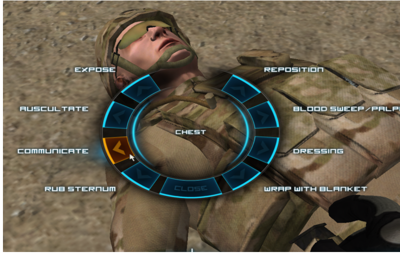
Fig. 1. TC3Sim game-based learning environment.