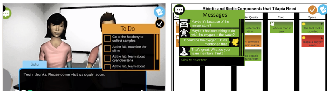
Figure 1. Screenshot of the collaborative game-based environment

To situate our design, we briefly provide an overview of the collaborative game-based environment that was designed based around PBL for middle school. As part of the PBL process, learners collaboratively engage in the process of scientific inquiry that emphasizes meaningful knowledge construction (Hmelo-Silver & Barrows, 2006). In our collaborative game-based PBL environment, students work in groups of four and solve an aquatic ecosystems problem that reflects grade six life science subject matter. Students engage in several phases of inquiry in the game, individual investigation where they collect data from the learning environment and collaborative brainstorming where students share notes and negotiate the relevance of the information to the overarching problem (See Figure 1). Students' interaction data as they engage with the learning environment are captured and can be surfaced to the teacher. This information is then available to the teacher in real-time or as reports at the end of the classroom session.