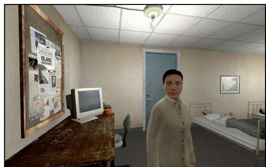
Figure 2. WOZ-enabled CRYSTAL ISLAND

We propose a dynamic Bayesian network (DBN) approach to modeling director agent's decision-making strategies. The approach supports learning models from a corpus, integrating different sources of evidence affecting director agent's decisions, and the capability of operating in real-time. First, to create empirically driven models of director agent decision-making, we conducted a corpus collection with thirty-three participants using the WOZ-enabled version of CRYSTAL ISLAND. Throughout the corpus collection, detailed narrative interactions logs were collected for all wizard decision-making and all navigation and manipulation activities within the virtual environment. Second, the resulting corpus of data was utilized to learn models of director agent decision-making strategies using dynamic Bayesian networks. To create the DBN models, the network structure was manually engineered, and the parameters were learned. Each of the network structures was integrated with different narrative observable